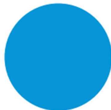
401(k) Asset Class Allocation

The plan's investment funds fall into major asset classes, which range from conservative to aggressive types of investments. The chart below shows your asset allocation, or how your money is divided among asset classes.