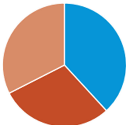
401(k) Balance by Source of Contributions